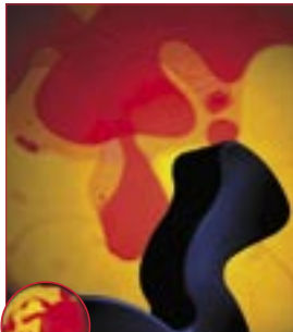
Optional oil wheel 2 Red/yellow oil wheel Order number P/N 91611220