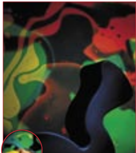
Standard red/blue/yellow oil wheel Order number P/N 91611219

Ten easy interchangeable gobo patterns give the oil effect depth while shaping the projection to your own unique environment and shielding from glare. The gobo sits in an easy-access slot on top of the fixture.