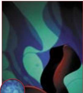
Optional oil wheel 3 Blue oil wheel Order number P/N 91611225